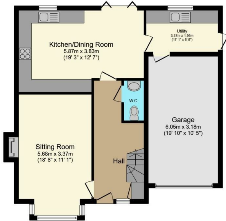
Ground Floor Floor area 82.1 sq.m. (884 sq.ft.)